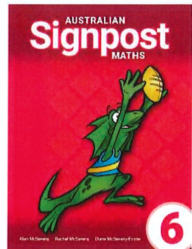
Signpost Maths Yr 6