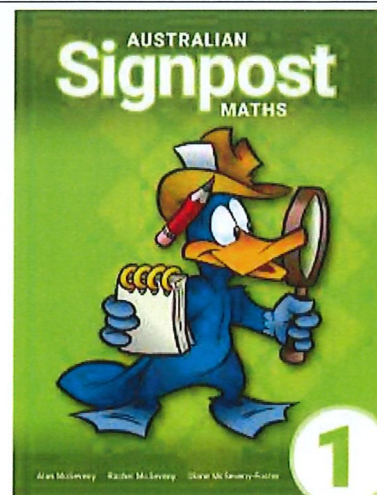
Signpost Maths Yr 1